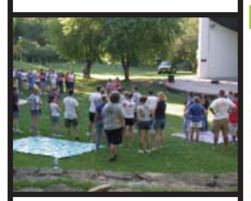
Above: Participants have fun while working on team-building skills, one of many YLC activities. Below: Clark Electric's 2004 YLC representatives.

The YLC will be held July 20, 21, and 22 on the UW-River Falls campus. Remember—this trip is paid for by your cooperative.